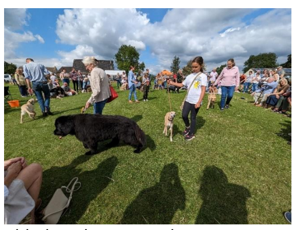
added to the atmosphere.

the production costs of What's On for the forthcoming year.