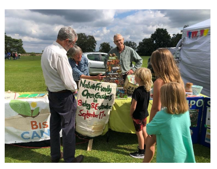
BisCAN at Oakridge Show

or sooner. It commissioned a report by Small World Consulting on the carbon emissions of the area and a proposed pathway to net zero. Among much else, it found that Cotswold residents' emissions are c. 26% higher than the UK average, primarily from food and drink (22% of total emissions), flying (16%), and vehicle fuel and household energy (both 13%). Compared to UK averages, our food and drink footprint is c.10% higher; electricity and driving are c. 35% and 30% higher, and emissions from flying around 150% higher i.e. two and a half times the average.